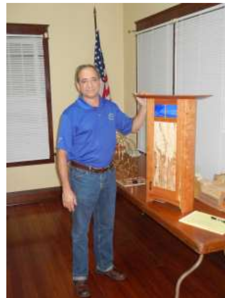
Raul Darriba – A beautiful Mahogany wall cabinet