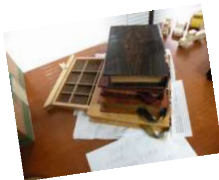
Art's stack of books jewelry box.