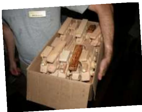
Box of 10 trains Bill made for the toy drive.