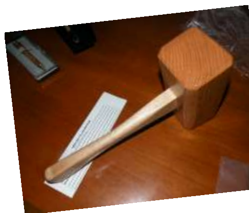
George wooden mallet