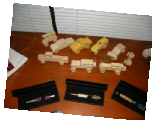
The last of Lloyds contribution to the toy drive.