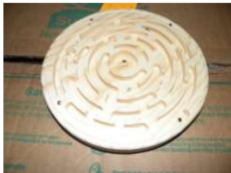
Bill Powell made 50 mazes for the toy drive